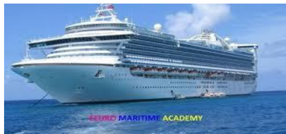
A Cruise Ship

Life in merchant navy can be adventurous for all those with wanderlust. The long periods of solitude notwithstanding, the opportunity to see the world and get paid while doing so, just cannot be argued with. Jobs in Oil Tankers are also one of the options for people trained as Marine Engineers.