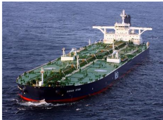
An Oil Tanker